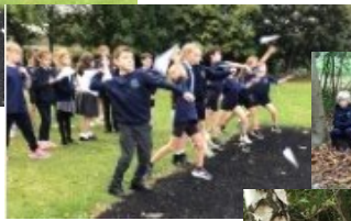
Year 1 science!