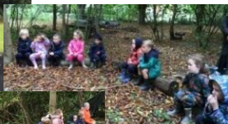
Class 1 Forest Fun