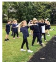
Year 5 science!

Great to see our outdoor spaces being used across the curriculum.