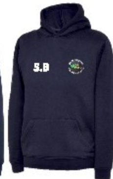
PE Hoody - £10.00 / £11.00 Full Zip