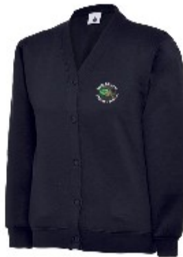
Cardigan - £10.00