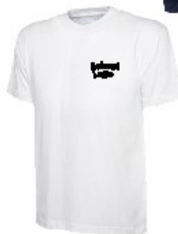
PE Top - £10.00