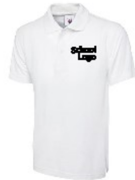
Polo Top - £7.50