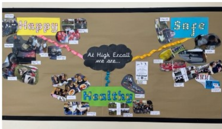
Keeping happy, healthy and safe

During 2020 we adopted the new statutory Relationships Education, Relationships, Sex Education and Health Education guidance from the DfE. This has been incorporated into our PSHE curriculum using the PSHE association planning and resources.