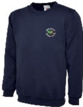
Sweatshirt - £10.00

www.shropshireembroidery.co.uk info@shropshireembroidery.co.uk 07807976007