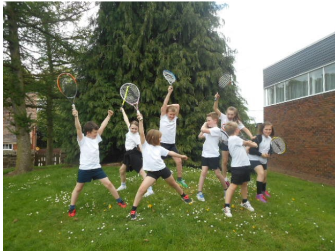
The tennis team after a successful event.

The winning team is presented with the Brenton shield, which is held for the year.