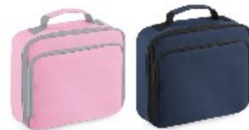
Personalised Lunch Bag - £7.50

Orders can be collected from the school office, from the school playground or from the shop premises at Unit 25, Trench Lock 3, TF1 5ST