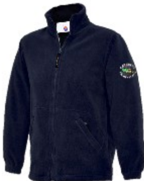
Fleece Jacket - £12.00