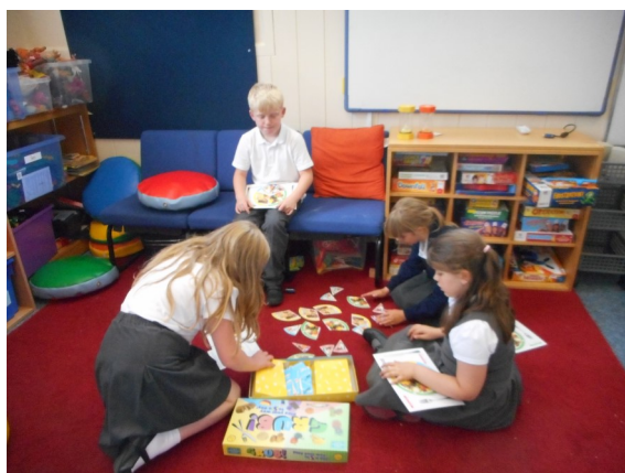
After school Chill Club

Children will have an increasing but realistic amount of homework as they get older.