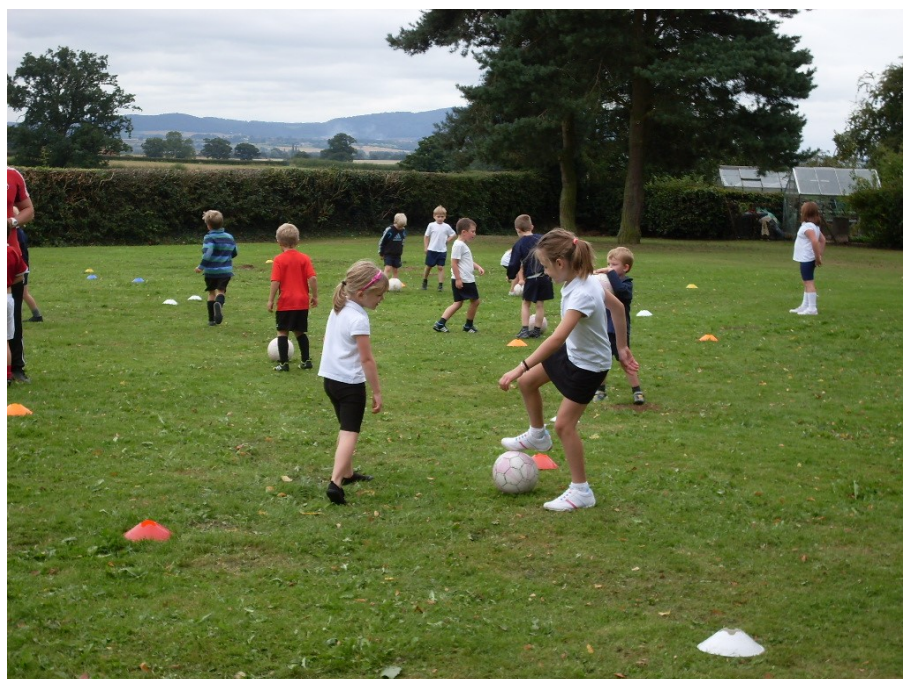
Football coaching in school PE lessons

The full results, including progress measures, can be found on the school website as they become available.