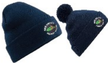
Woolly Hat - £5.00